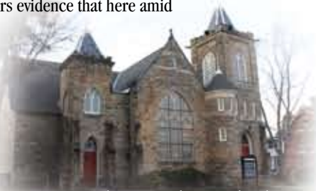
The First Presbyterian Church

The population of Wellsboro is 3,500 and Tioga County has 41,500 residents. An additional 5,000 people live within a radius of five miles and another 5,000 within ten miles.